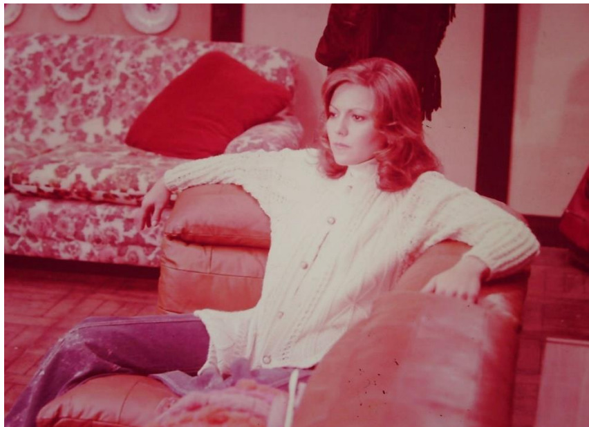
Canada's first action heroine? Brenda Vaccaro in Death Weekend

Well, I got a lot of flak for doing Death Weekend after doing Wedding in White . 'How could you?' they would say. My reply was 'To earn a living!'. I quickly turned to a genre film, though I didn't see it as a horror film at the time. I was accused of hating women. That was the analogy of some critic in Ottawa who runs the film libraries, which of course is ridiculous.