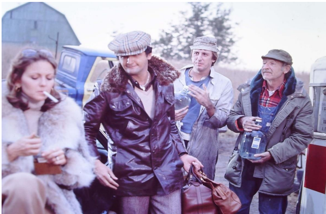
Country encounters: tropes of rural depravity in Death Weekend

I didn't set out to make a film about home invasion particularly. I have never seen The Last House on the Left , I have heard that it is similar to my film, somewhat. No, my aim specifically was about the female. It was time to put the female out there and make her a hero, but in a realistic way. So I think Death Weekend and the films I was making in the seventies were not sort of copycatting some others. I think some of the home invasion films that were done were using a very specific kind of formula that had already been made a number of times before. These had been highly successful, so I could understand why they were doing that. But I don't think my films were following that formula, I felt mine had a good decent storyline so that it wasn't just an excuse to have a bloodbath!