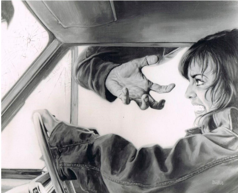
Real life road encounter as fiction: the original storyboards to Death Weekend